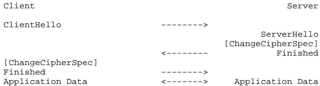
Fig. 2 - Message flow for an abbreviated handshake

The contents and significance of each message will be presented in detail in the following sections.