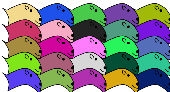
Figure 3: Color series — pstricks example 3

\newcommand*\SheepHead {\begin{pspicture}(3,1.5) \pscustom[liftpen=2,fillstyle=solid,fillcolor=sheep!!+]{% \pscurve(0.5,-0.2)(0.6,0.5)(0.2,1.3)(0,1.5)(0,1.5) (0.4,1.3)(0.8,1.5)(2.2,1.9)(3,1.5)(3,1.5)(3.2,1.3) (3.6,0.5)(3.4,-0.3)(3,0)(2.2,0.4)(0.5,-0.2)} \pscircle*(2.65,1.25){0.12\psunit}% Eye \psccurve*(3.5,0.3)(3.35,0.45)(3.5,0.6)(3.6,0.4)% Muzzle % Mouth \pscurve(3,0.35)(3.3,0.1)(3.6,0.05) % Ear \pscurve(2.3,1.3)(2.1,1.5)(2.15,1.7) \pscurve(2.1,1.7)(2.35,1.6)(2.45,1.4) \end{pspicture}} \newcommand*\Sheep {\SheepHead\SheepHead\SheepHead\SheepHead\SheepHead} \definecolorseries{sheep}{rgb}{step}{rgb}{.95,.85,.55}{.17,.47,.37} \resetcolorseries{sheep} \psset{unit=0.5} \begin{pspicture}(-8,-1.5)(8.5,7.5) \rput(0,6){\Sheep} \rput(0,4.5){\Sheep} \rput(0,3){\Sheep} \rput(0,1.5){\Sheep} \rput(0,0){\Sheep} \end{pspicture}